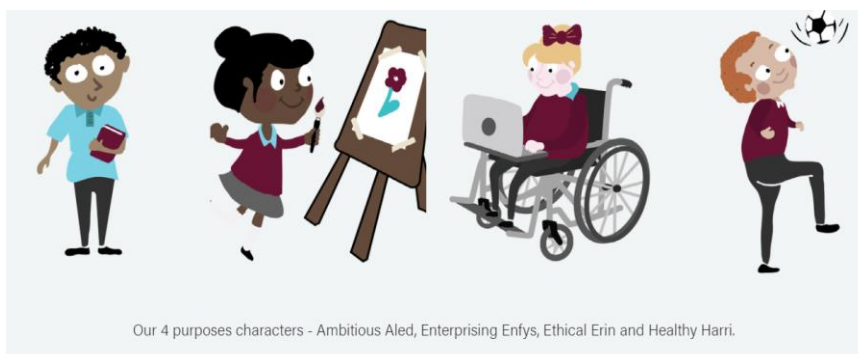
Our 4 purposes characters - Ambitious Aled, Enterprising Enfys, Ethical Erin and Healthy Harri.

Here at St Mary's, we have designed a curriculum to enable our learners to develop in a way described in the four core purposes.