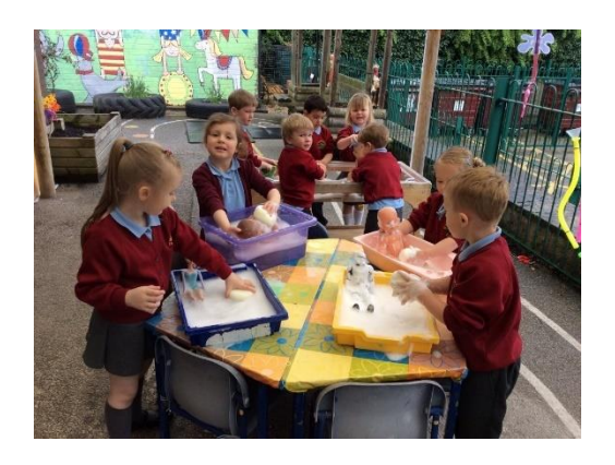
Admission to Reception

Please note: attendance at our Nursery does not automatically guarantee admission to Reception.