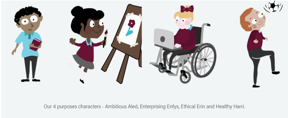
Our 4 purposes characters - Ambitious Aled, Enterprising Enfys, Ethical Erin and Healthy Harri.

Our curriculum is inclusive and suitable for all learners of differing ages and abilities. It is broad and balanced, encompassing a variety of topics and enquiry questions.